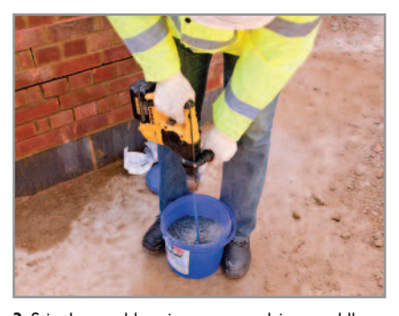
3. Stir thoroughly using a power-driven paddle mixer. Do not attempt to mix by hand as this will result in inadequate mixing