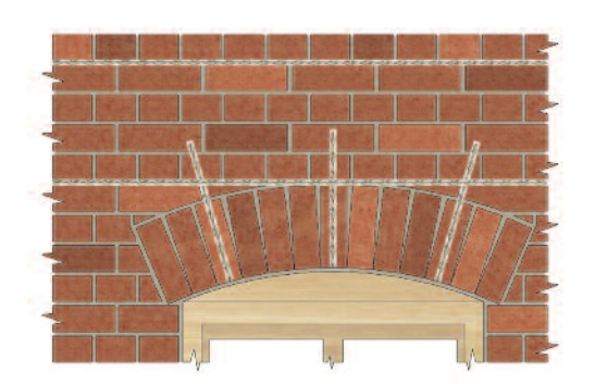
Repairing brick arch lintels