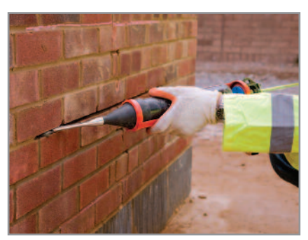
5. Inject into the slot or hole in a continuous operation. Typical working life of the mixture in the pail is around 2 hours with re-agitation. The cartridge should be emptied within 5 minutes. If the injection process is interrupted for any reason, empty any cartridge contents back into the bucket and re-mix until it again reaches a smooth injectable consistency